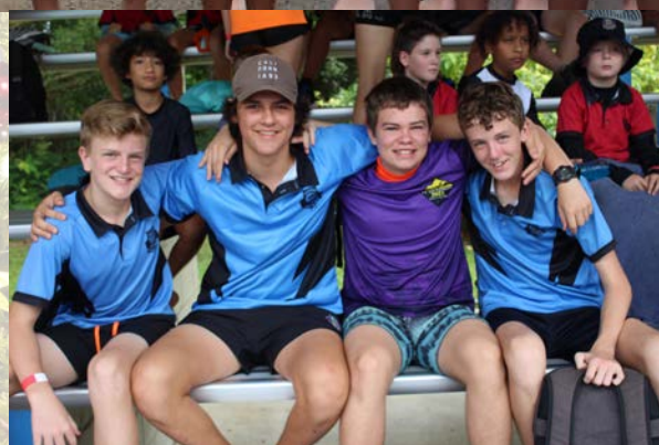
CUDAS - 2022 WINNERS